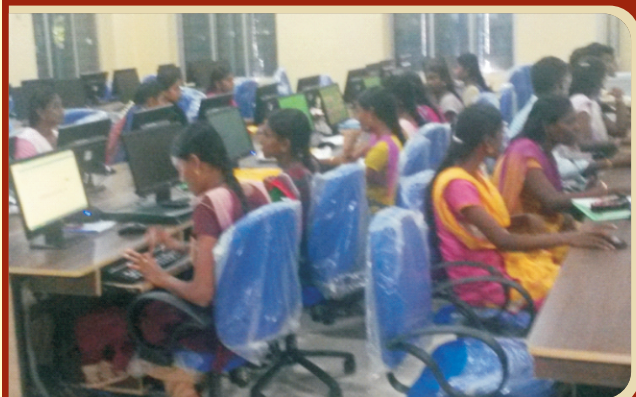
Students attending Online Test at the Computer Laboratory for the selection of ICICI BANK Sales Officer Post