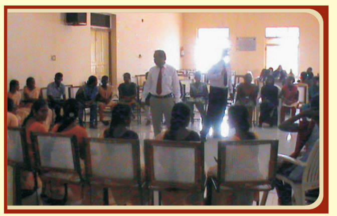
Experts from Integrated Enterprises India Pvt. Ltd conducting Group Discussion